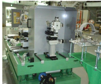
The slit is installed in a XAFS instrument.